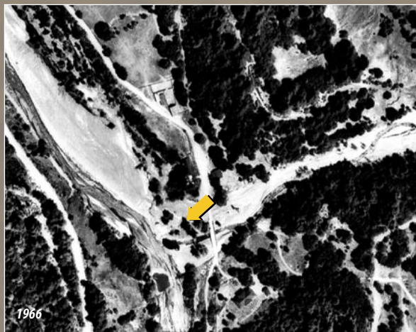
These aerial photographs show changes in the channel shape and sedimentation levels from the flood of December 1964.